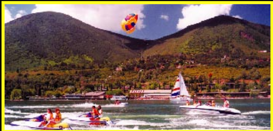
KONOCTI HARBOR RESORT & SPA ■

And during the Lake County Summerfest... Sports fans... this one's for you! It's a two day golf extravaganza, the likes of which have never even been imagined, in these parts. Joe Montana, Johnny Unitas, Bart Starr, Ken Stabler, Jim McMahon, John Brodie, Len Dawson, Jim Plunkett, Earl Morrall, Joe Kapp, Daryl Lamonica... to list but a few of the notable former NFL Quarterbacks invited to play in the classiest Shootout this side of the border. The weekend traditionally kicks off the Summerfest, on Friday night and begins with a Poolside Pairings and Luau Party, with your chance to get up close and personal with these NFL greats. Then it's off to an outdoor show, but you've got to get to bed early... because the next morning it's the Sunrise Champagne Breakfast, and then off to the Shootout, where legend has it that nearly 10,000 sports fans flock annually to catch a glimpse of their heroes. Then after a day of fun in the sun at the golf course, it's back to the Konocti Harbor Resort and Spa, and a night of toasts...roasts... and awards... with the Quarterbacks... a sports and memorabilia auction... plus a concert, featuring some of the biggest names in show business. As usual, a Konocti Presents event... is "One of a Kind" and the Pepsi-One Celebrity Quarterback Shootout continues the tradition.